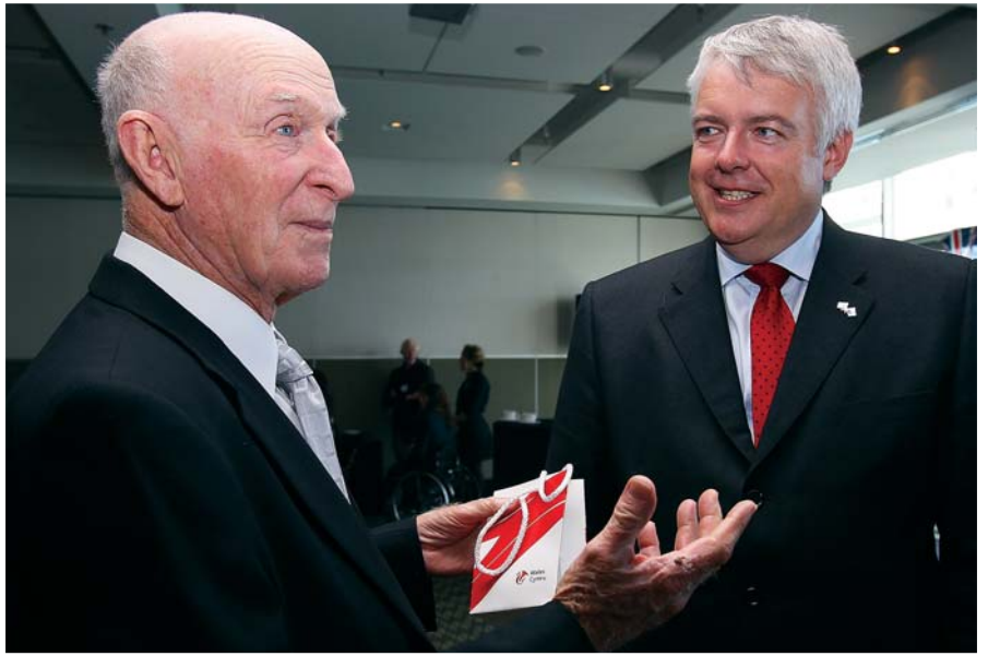
Sir Murray Halberg with Welsh First Minister, Rt. Hon Carwyn Jones.

"Wales is committed to providing a first class environment for New Zealand's athletes and the combination of world class training facilities, proximity and quality of accommodation, access to state of the art support services together with a Welsh welcome that is second to none, is a compelling offer which has resulted in Paralympic New Zealand's decision to choose Wales," he says.