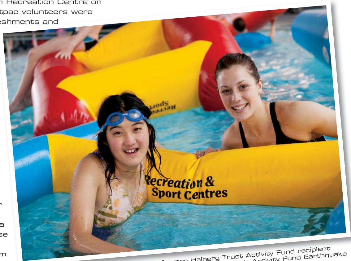
Paralympic swimming champion and former Halberg Trust Activity Fund recipient Sophie Pascoe joins children in the water to celebrate their Activity Fund Earthquake Initiative funding grants.