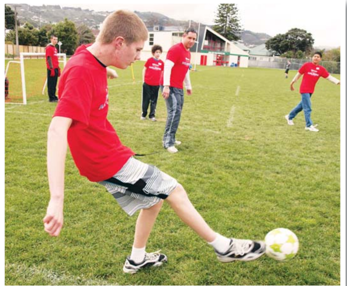
A young participant kicks off the Halberg Trust Adaptive Soccer Have a Go Day in Lower Hutt.

"Recently SportZone has been running local adapted football programmes for adults and we've been blown away by how popular and beneficial the game can be for the participants."