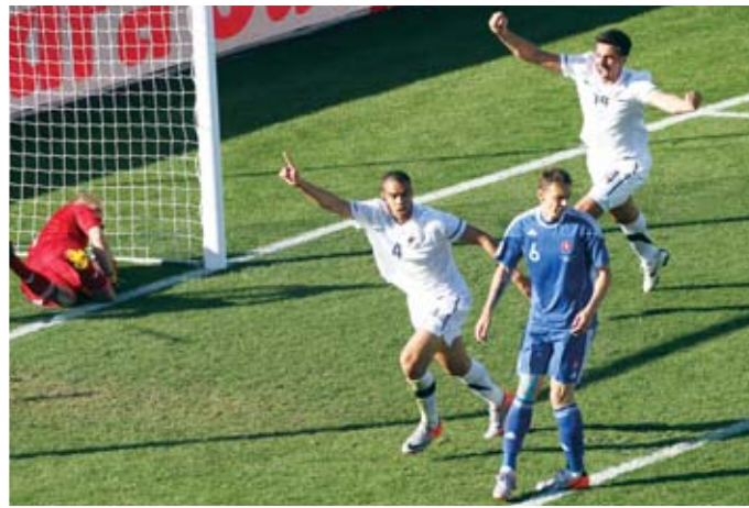
Winston Reid's last gasp equalizer against Slovakia which proved the most popular among the 8 finalists for New Zealand's Favourite Sporting Moment.

Despite a mixed 2010, Valerie Adams continued her stranglehold on the Sportswoman of the